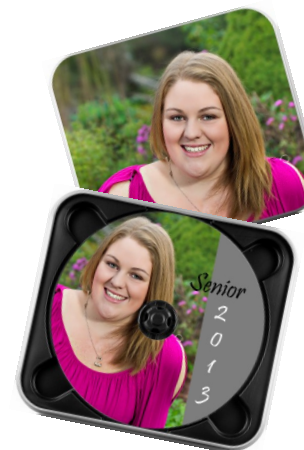
Slideshow DVD with metal photo case